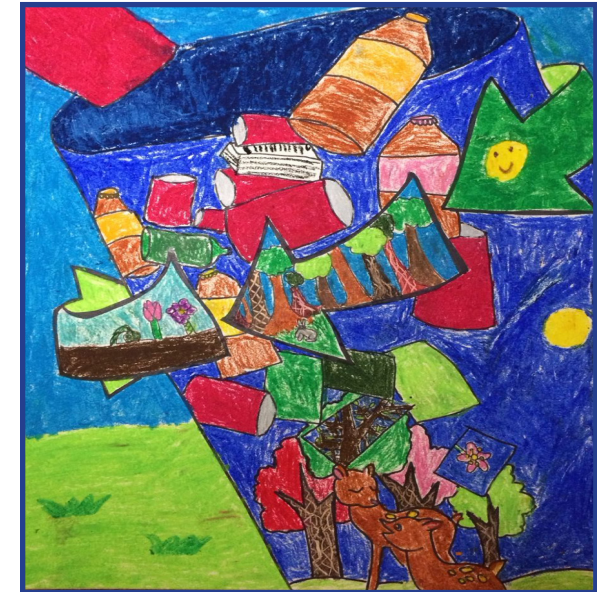
Art rendered by fourth-grader Angelina Xu of East Brunswick.